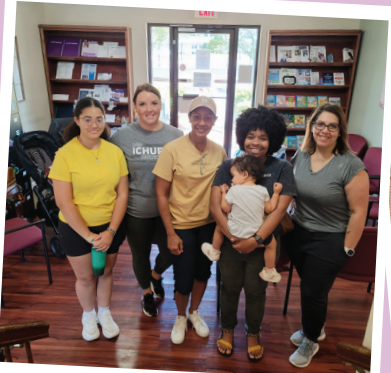
IChurch service day