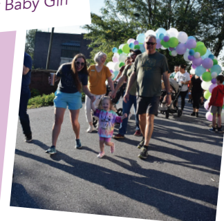
Congratulations to our winning team, Friends For Life, for raising the most money for the Walk For Life!