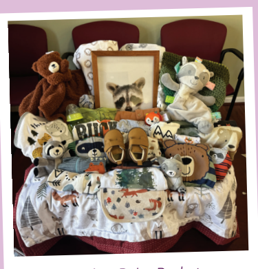
Another Baby Basket