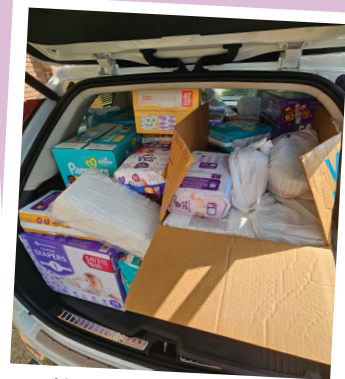
Hurricane Helene relief