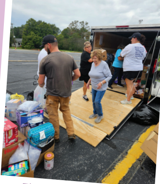
Thank you to our staff, volunteers, and donors for your work in coordinating donations and drop off for Hurricane Helene relief!