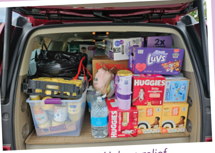
Hurricane Helene relief