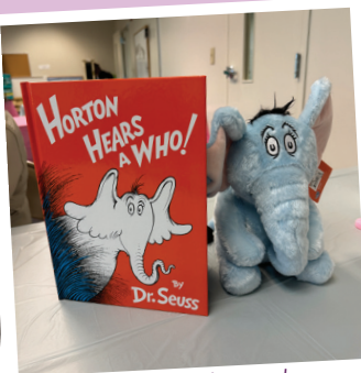
Dr. Suess themed baby shower