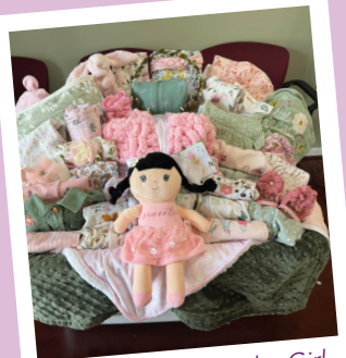
Baby Basket for Baby Girl